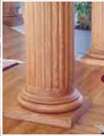
1 Residence— Medford, Oregon Roman Doric Column with Doric Cap & Base