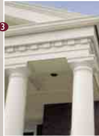
3 Church— Fresno, California Roman Doric Column with Doric Cap